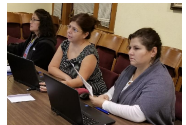
Computer class participants learn to use technology

Additionally, Word and PowerPoint workshops combine literacy skills with technology allowing learners to tap into their creative side.