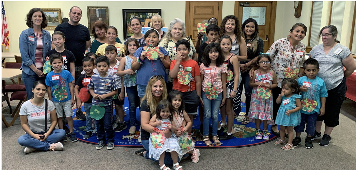
Twelve families participated in the September 21st, 2019 inaugural Family Literacy Program meeting.

Parents and caregivers are their children's first and most important teachers. Recognizing this important fact, many adults enroll in the A. K. Smiley Public Library's Adult Literacy Program to improve their reading and writing so that they can read to their children, help them with their homework, and communicate with their children's teachers.