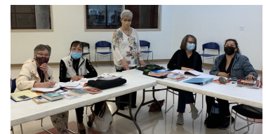
Literacy Teams meet at YMCA of the East Valley

Adult Literacy began a new partnership with YMCA of the East Valley, which welcomes several adult literacy teams to meet weekly at their facility. Likewise, Clement Middle School hosts weekly literacy meetings. The off-site locations make it